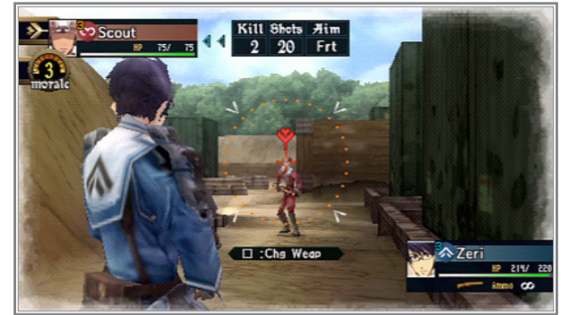
Future cadets getting acquainted with standard equipment

The demo version of Valkyria Chronicles™ II is available at the PlayStation®Store. Note that you must have a valid PlayStation®Network account to download the data.